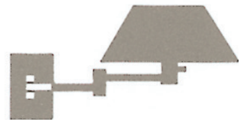
NW909 Shown with S02 shade